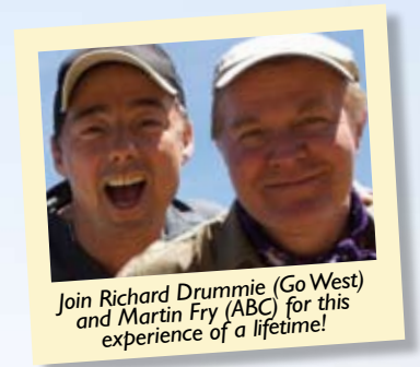
Join Richard Drummie (Go West) and Martin Fry (ABC) for this experience of a lifetime!

To experience this fascinating country we require a non-refundable registration fee of £199 plus your commitment to raise a minimum of £3000.